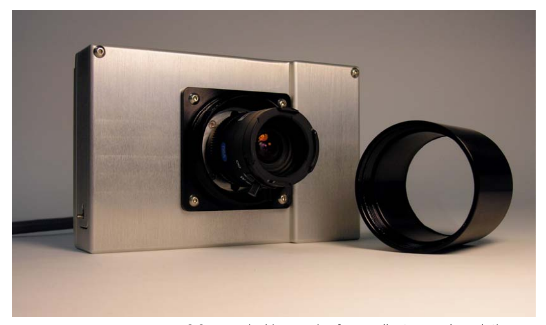
3.2 megapixel image size for excellent ground resolution

Re-engineered to be the simplest and most flexible visible and NIR camera available. The new ADC Air has improved resolution, faster performance, greater capacity and new features all in a ruggedized weatherproof enclosure.